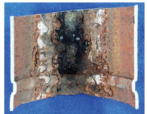
Figure 6. Pipe from dry FPS showing an air-water interface where a puddle had been. Note the discrete deposits and severe under-deposit pitting in this area.