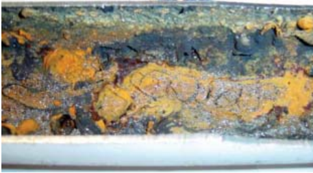
Figure 2. Discrete deposits on interior of steel pipe. These deposits are formed by microbes depositing materials from water and by the accumulation of corrosion products.