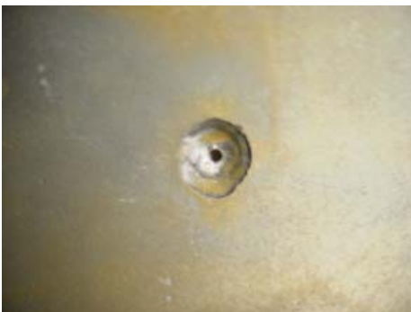
Figure 4. Pinhole leak in dry galvanized FPS pipe. This pitting occurred under discrete deposits located where water puddles had been.