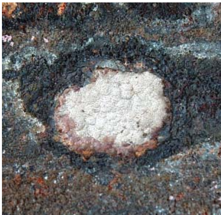
Figure 3. Under-deposit pitting corrosion showing distinct pits-within-pits, which are characteristic of MIC. This type pitting can occur at 0.200” per year and can penetrate FPS pipes within a few months after installation.